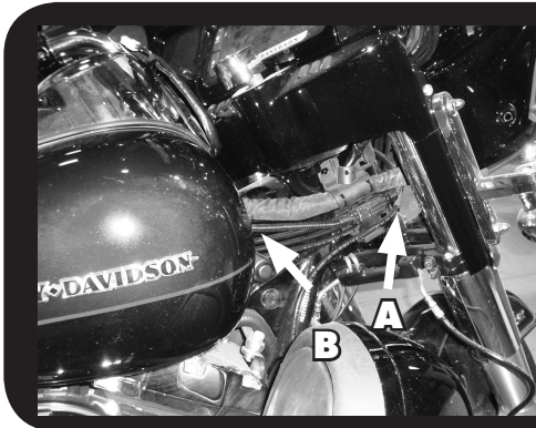
Figure 1.3 - Stock Harness and Amplifier's Harnesses Passing From Fairing To Just In Front Of Tank (Arrow A). Cable Tying the 2 Amp Harnesses To The Main Bike Harness Just In Front Of The Tank (Arrow B) Allows The Amp Harnesses To Go Up Towards The Tank's Chrome Console Easier And Makes For a Cleaner Install.

Step #1: The power/ground harness and supplied long rear harness for Ultras will pass together under the inner fairing where the main wire harness passes through on the brake side of the bike. Loosen the tank's "chrome console" and run wires up and over the gas tank, but under the tank's chrome console. There is a provision on the front of the tank console for wires to pass. NOTE: Although not necessary, the power and rear harnesses can go under the gas tank if you choose to remove and re-install the tank.